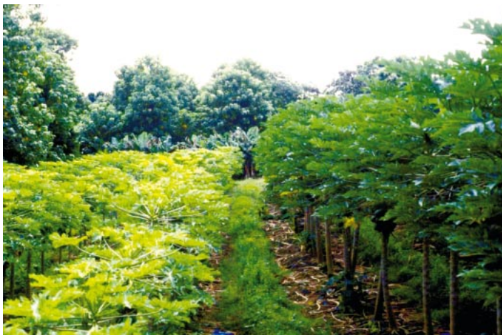
FIG. 1. Field plot in Hawaii showing papaya trees with and without transgenic disease resistance. The small, yellowish trees on the left have the ring-spot virus, whereas the larger, transgenic trees on the right do not (see Box 2).

example, transgenic Escherichia coli that produce human insulin have replaced animal-derived insulin for medical uses; also, genetically engineered bacteria produce rennet, which is used commonly by cheese processors in the United States and elsewhere. Bovine growth hormone produced by transgenic bacteria has been used to increase milk production in many U.S. dairy farms. Transgenic microorganisms are being developed for bioremediation of toxic compounds (Box 4), and for removing excess carbon dioxide from the atmosphere. Experimental field tests of microorganisms intended for release into the environment include bacteria with visual markers, biosensors of toxic chemicals, insecticidal properties, and reduced virulence.