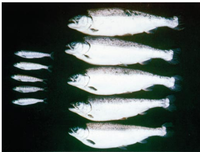
FIG. 2. Non-transgenic and transgenic coho salmon ( Oncorhynchus kisutch ) at one year of age. The larger fish have a transgene for faster growth rate.

Animals. —Animals have been genetically engineered to grow faster, resist diseases, tolerate cold, produce organs for transplants, or produce biologically active, therapeutic proteins (NRC 2002 b ; Table 1). Much of this research is still exploratory. Fast-growing salmon that will increase production of farm-raised fish