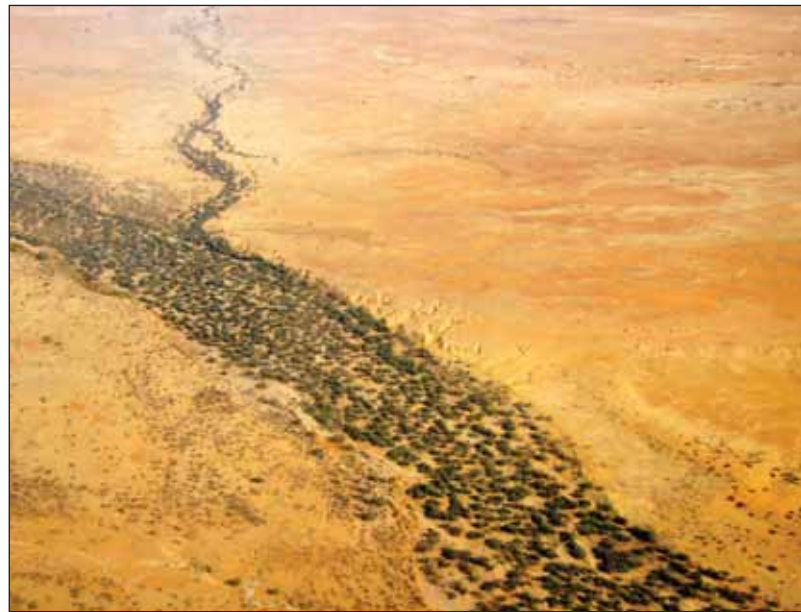
Figure 1. In arid regions, dry riverbeds may be where the most diverse and most dense vegetation is found, as shown in this aerial photograph of a dry river channel in the Lake Eyre Basin, Australia.

The drying of a riverbed represents a loss of longitudinal connectivity for aquatic biota as well as for physical aquatic processes throughout the river network (Figure 2). During a flow event, previously isolated populations