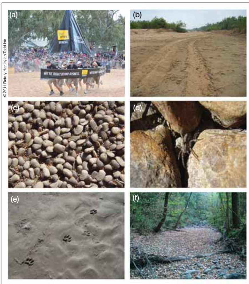
Figure 3. Values of dry riverbeds: (a) cultural significance – the Henley-on-Todd Regatta (Todd River, Northern Territory, Australia); (b) vehicle transport route (Mitchell River, Queensland, Australia); (c) egg banks for aquatic biota, such as clam shrimp (Branchiopoda: Spinicaudata) (Northern Territory, Australia); (d) habitat for terrestrial biota, such as wolf spiders (Araneae: Lycosidae) (Northern Territory, Australia); (e) wildlife corridors (Tagliamento River, Friuli-Venezia Giulia, Italy); and (f) storage sites for organic matter, such as leaf litter (Riera de Fuirosos, Catalonia, Spain).

Dry riverbeds often act as egg banks for aquatic invertebrates and seed banks for aquatic plant, algal, fungal, and bacterial propagules (Williams 2006; Lake 2011). Some aquatic crustaceans live exclusively in temporary waters and require, or benefit from, a desiccation phase in order