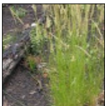
Post Fire Growth