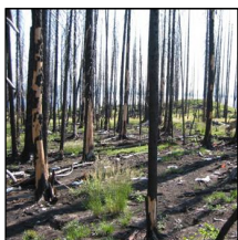
Post Fire Growth