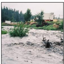
Post Fire Flooding