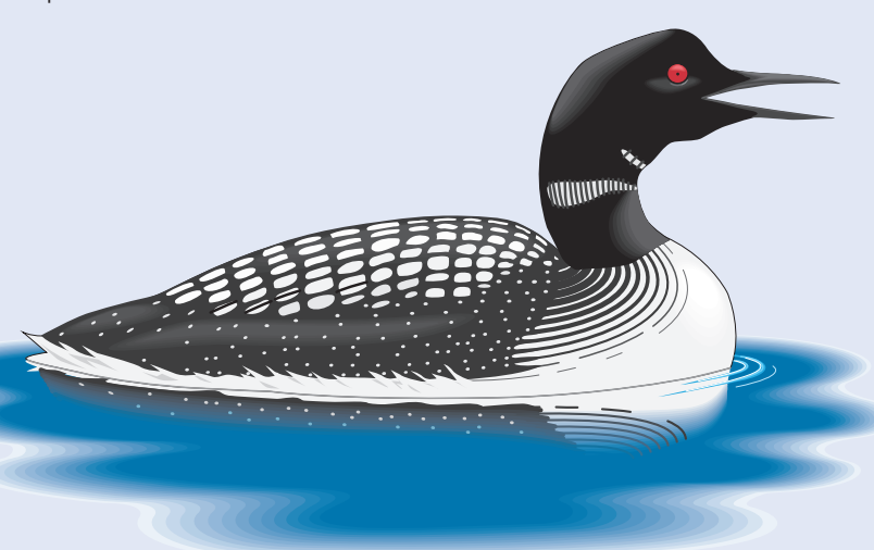
Common Loon (Gavia immer), Minnesota State Bird