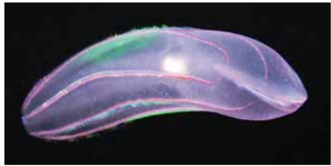
Figure 4. The bioluminescent comb jelly, Beroe cucumis , occurs at depths that can be penetrated by artificial light.

Several studies have shown that the attraction of nocturnal Lepidoptera to street lights at night results in aggregations upon which opportunistic bat species often prey