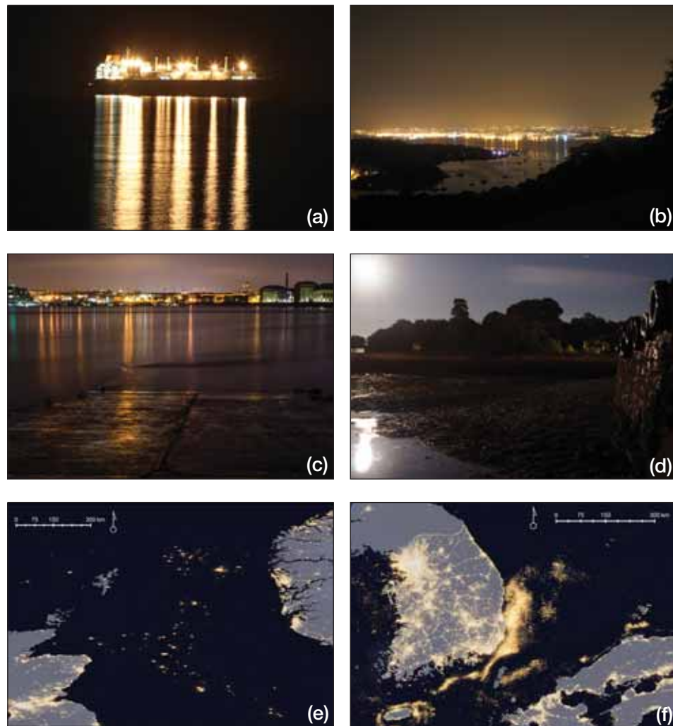
Figure 2. Sources of artificial light in marine ecosystems. (a) Artificial lights from ships that anchor in Falmouth Bay, UK. (b) The lights of Plymouth, UK, illuminating the Tamar Estuary and its creeks and tributaries. (c) Decorative, harbor, and municipal lighting spilling onto the Tamar, viewed from Cremyll, UK. (d) Moonlight cast onto the shores of Cremyll in the Tamar Estuary, UK. (e) Oil rig lighting across the North Sea captured by satellite. (f) Light fisheries target squid spawning grounds in the Tsushima Strait.

Light intensity and spectra are especially useful cues by which organisms regulate their depth in the pelagic environment where landmarks are absent. While some species have evolved the ability to navigate horizontally via detection of the Earth's geomagnetic field, the visible portion of the electromagnetic spectrum is one of the most important means of vertical navigation. Consequently, light intensity informs the vertical movement of zooplankton species that migrate to surface waters at night to graze while avoiding predation (Cohen and Forward 2009). Given that artificial skyglow is more widespread than direct artificial light (Cinzano et al. 2001) and frequently occurs at intensities greater than (and thus directly interferes with) natural lunar sky